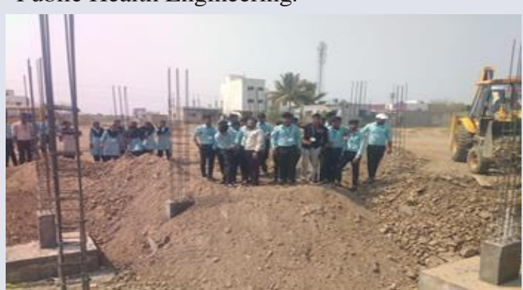
Industrial Visit at Building Construction, Pandharpur

On 09 August 2024 an industrial visit was organized by departnment of Civil Eng. to Water Treartment plant, Pandharpur for Second & third year students as a part of curriculum. The visit was helpful to enhance the knowledge about the Public Health Engineering.