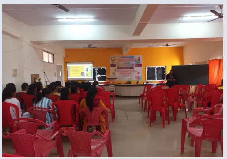
Personality development Program